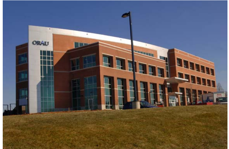
ORAU's New Center for Science Education