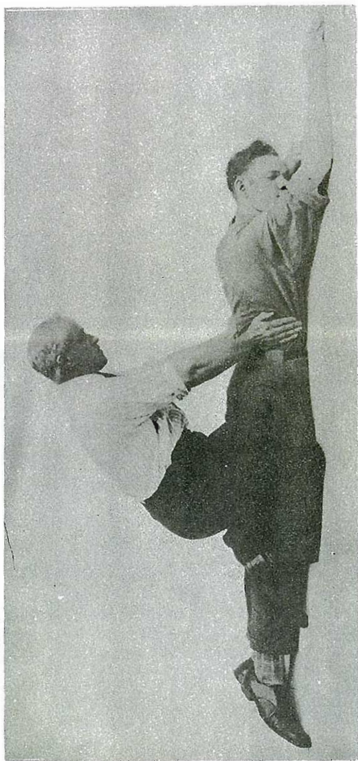
FIGURE 1.—Resuscitation position 1